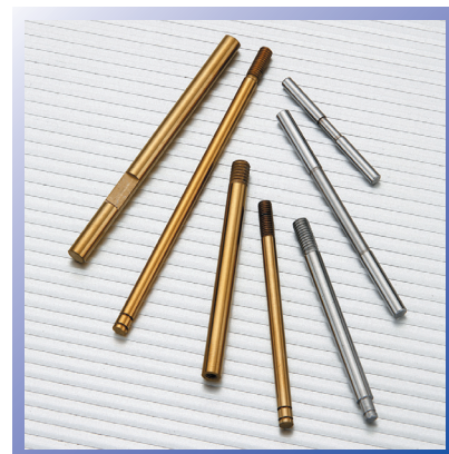
1.模型汽車軸心 model of automobile shaft 用於模型汽車、沙灘車避震器軸心 Suitable for model of automobile, and beach bicycle's shock shaft.

We already pass the ISO-9001, enhance the quality. Our business principle is continuous quality improvement to provide our customers satisfactory products. In the future we will increase our equipment for production. And provide the best professional shafts to our customers.