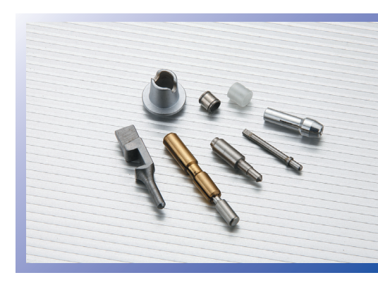
8.車削零件類 Turning products 材質，銅，鋁，不銹鋼，塑膠，快銷鋼...等 適用於各機械馬達 Material: copper, aluminum, stainless steel, plastic..etc. Suitable used for various machinery motors