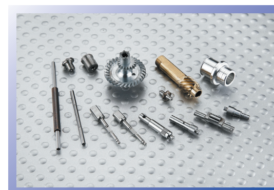
5.各式零件車削 various of turning products 運用於各式家電、馬達、機械產品 suitable used for various home appliance, motor, machine products etc.