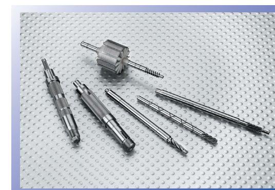
6.汽車用馬達軸心 automobile motor shaft 運用於汽車各類馬達軸心。天窗、電動椅、中控鎖等 suitable used for various automobile motor such as sun roof, power locks, power window etc.