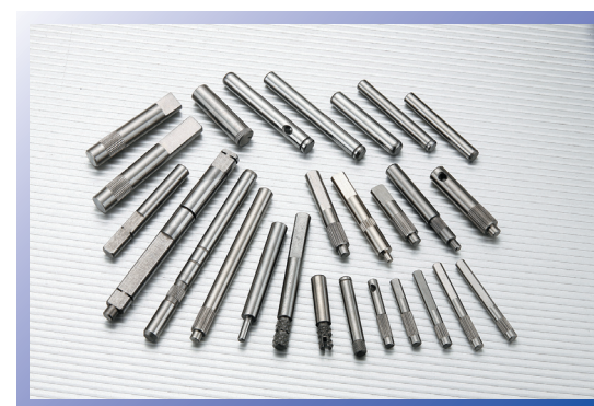
2.小馬達軸心 micro motor shaft 用於事物機，食品空調，機械等馬達 Suitable for office machine, air-conditioner, and machinery's motor.