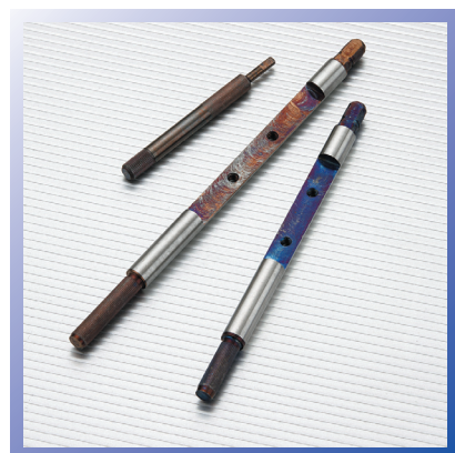
3.特殊材質軸心 special material shaft 材質SUS630運用於汽車零件 Material SUS630 Use on Automobile components