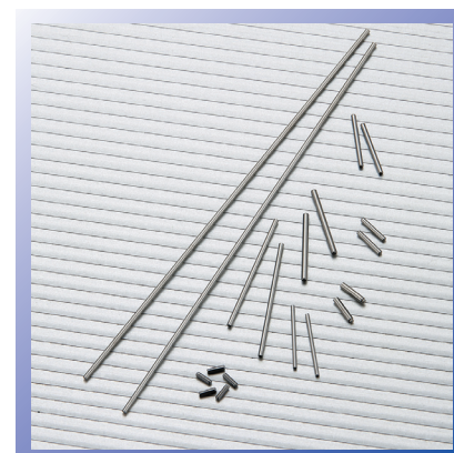
4.極微小軸心 Super micro diameter shaft 運用於手機，數位相機，望遠鏡 Suitable used for digital camera, cell phone, and telescope etc. components.